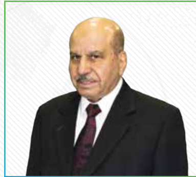
Member of the Board