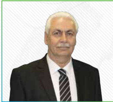
Member of the Board