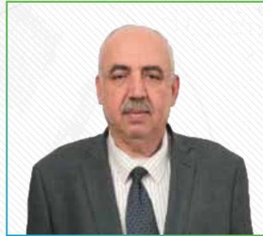
Member of the Board