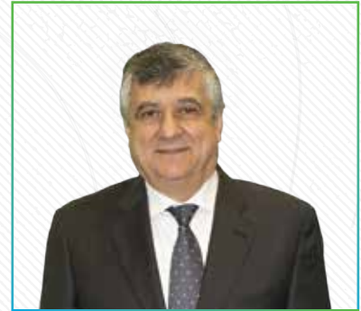
Member of the Board