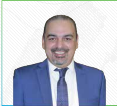
Member of the Board