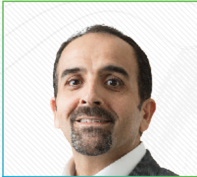
Member of the Board