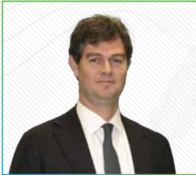
Member of the Board