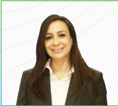
Member of the Board