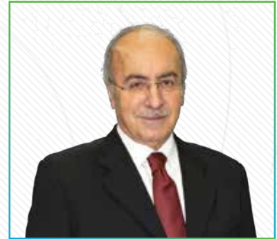
Member of the Board

Bachelor's Degree in Financial and Banking Sciences