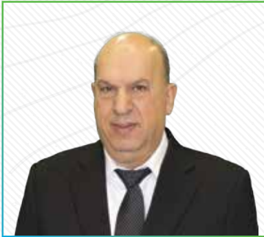
Member of the Board